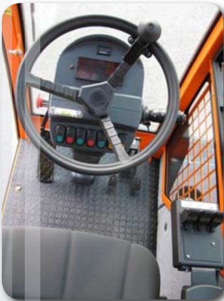
Finger tip electronic controls for hydraulic functions mounted on right side armrest. Column lever or pedal option for hands free forward/reverse travel.