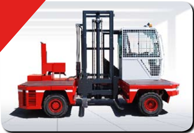
From 3 ton