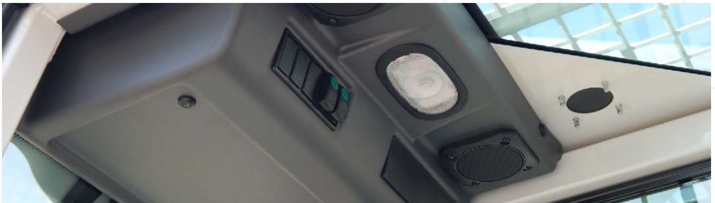
Cab with floor to ceiling front windshield, sliding glass door and right side double sliding glass windows.