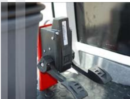
Dual pedal control option