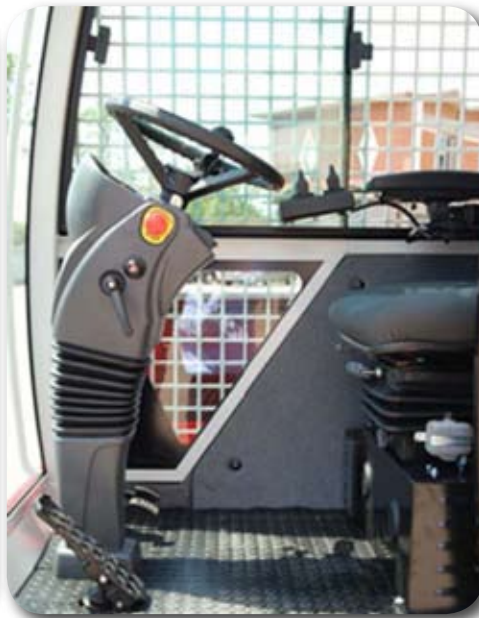
Safety grid over right side windows and sun roof.