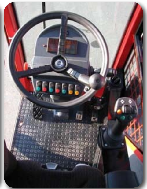
Hydraulic multi-function proportional joystick - simultaneous movements controlled by on board computer. Powerful defrosting system.